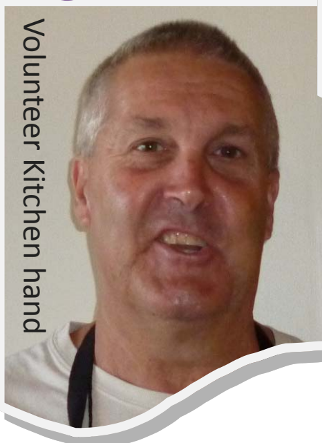
Volunteer Kitchen hand