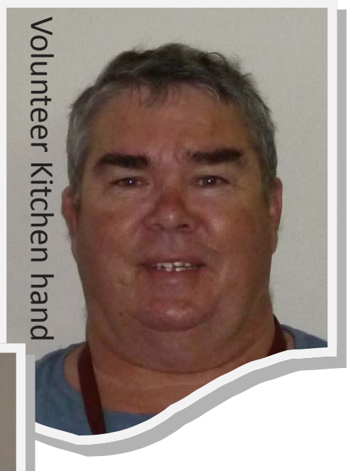
Volunteer Kitchen hand