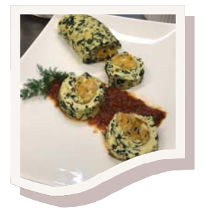
Egg & Kale Roulade stuffed with Roast Pumpkin, Onion and Garlic.